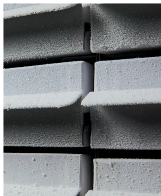
Sandringham, Johannesburg, South Africa